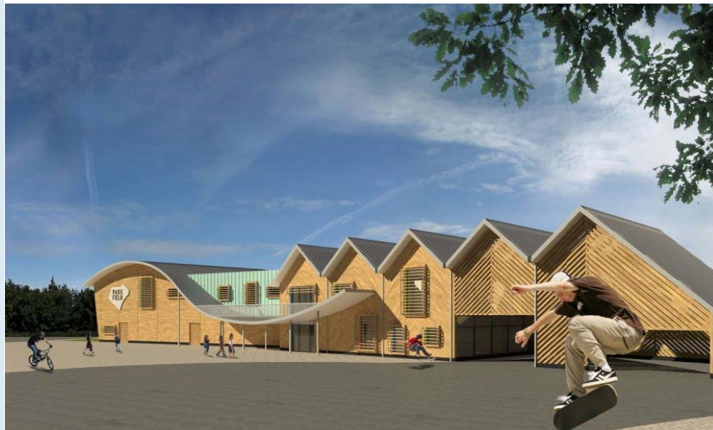
MyPlace Paignton: Torbay's flagship youth and visitor facility