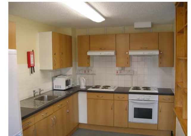
James Owen Court – procured through CFSW's mini competition process in eighteen working days and refurbished in just nine weeks.